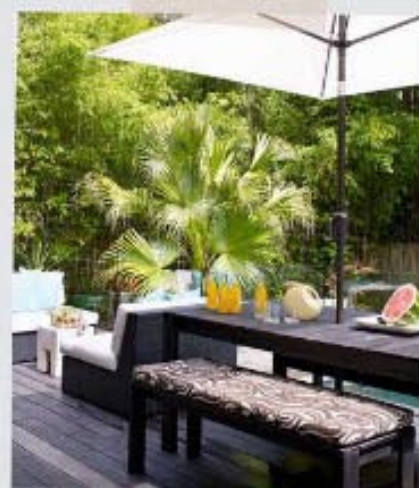
With its pool and lush palm trees, the backyard is inspired by the tropics.