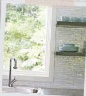
Glittering glass tiles make for a standout splashback.

"I tried to keep a lot of open space and I love low coffee tables and poufs for the kids, where they can play and draw."