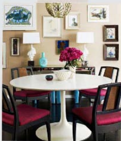
A design classic, the Saarinen 'Tulip' table adds mid-century appeal.