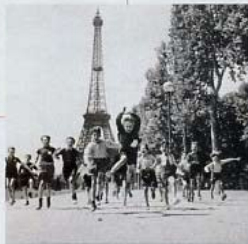
Les Jardins du Champ de Mars, 12" x 12"

Havens Fine Framing: havensfineframing.com .